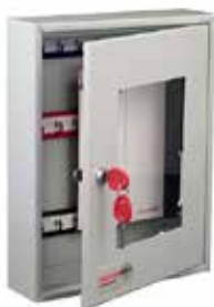
Key View Cabinets

A key cabinet is an important part of any management system which involves the use of large numbers of keys. These cabinets can be configured to store and record the removal and return of important keys and padlocks.