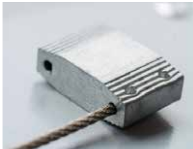
Stainless Steel Car Seal, 95cm Long (Pack 10)