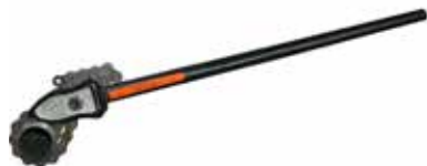
PETOL™-TITAN™ Chain Tongs