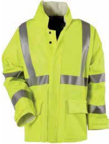
High-Visibility " Arc Flash " Parka