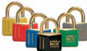
Vinyl Coated Brass Padlock