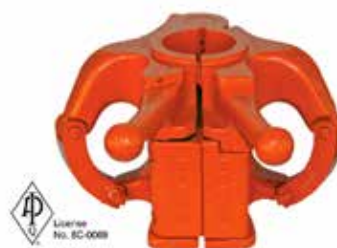
TITAN™ Tubing Elevator