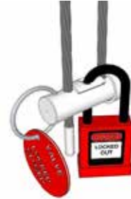
Reusable Cars Seal