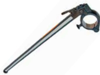
PETOL™ Shothole Casing Tongs