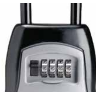
Select Access Portable Key Safe 5400D