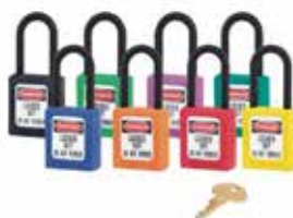
Master Lock 406 Non Conductive Safety Padlock