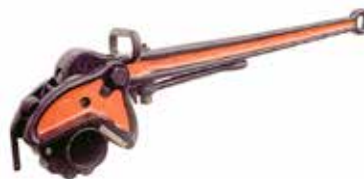
PETOL™ Drill Pipe Tongs