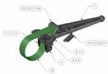
PETOL™ SURGRIP™ BELT TONG™ Strap Wrench