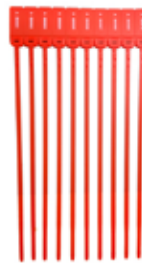
Plastic Car Seal (Pack of 100 Seals)