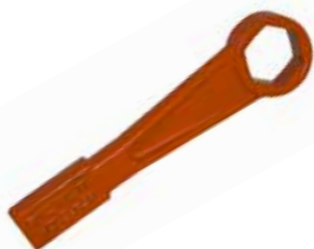
PETOL™ Striking Wrench