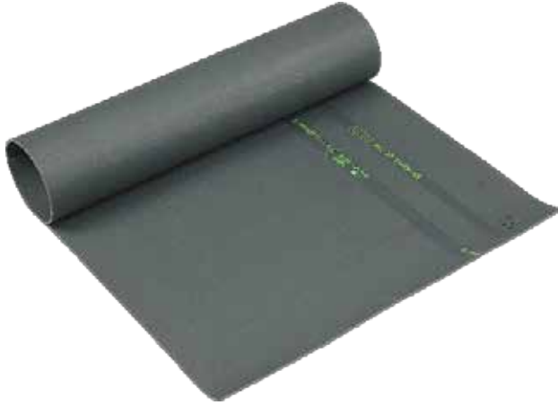
CATU Insulated Mat

Insulating Rubber Mats provides protection from electrical shocks due to earthing faults. The mats are made of best quality elastomer rubber and conforms to IEC 61111:2002. Finds application for both outdoor and indoor, the mats are placed in front of electrical panels and switchgears to provide safe working conditions for the technicians.