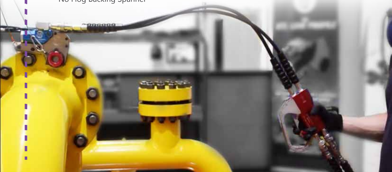
No Flog Backing Spanner