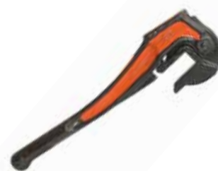
PETOL™ Suckerrod Wrench