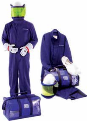
" Arc Flash " jackets and protective coverall kits (8 or 10 cal/cm2)