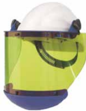
" Arc Flash " face shield kit (10 cal/cm2)