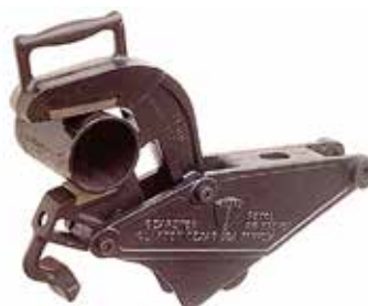
PETOL™ Rig Wrench