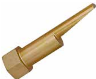
PETOL™ Flange Aligning Tool