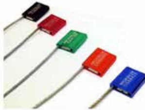
Car Seals, 1000mm X 2.5mm