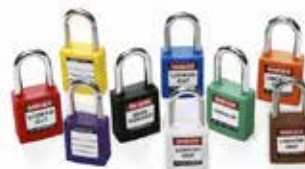
Brady Standard Padlock