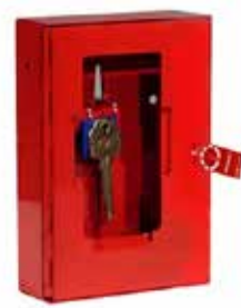
Emergency Key Cabinets