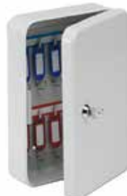
Keystore Value Cabinets