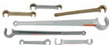
PETOL™ TITAN™ Valve Wheel Wrench