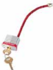
Circuit Breaker Padlock