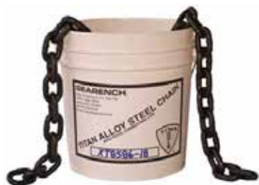
TITAN™ Cathead & Spinning Chain