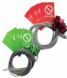
Pack of 10 Car Seals & Tags

Car seals are used as part of a car seal program to seal valves in the open and closed position. Used in conjunction with a car seal tag in red or green to indicate the status of the valve. Generally used on process critical valves to prevent inadvertent or accidental operation of the valve.