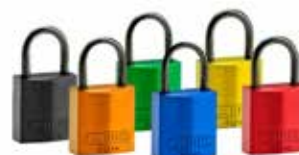
Brady Compact Alumunium Padlock