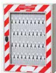
Deep Padlock Cabinet – High Capacity