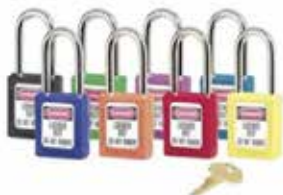
Master Lock Zenex 410 Safety Padlock

Padlocks with different keys, that can be opened with a Master Key.