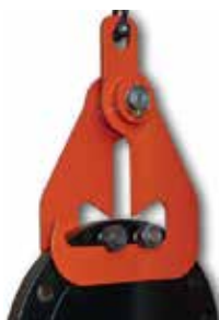
PETOL™ Flange Lifter