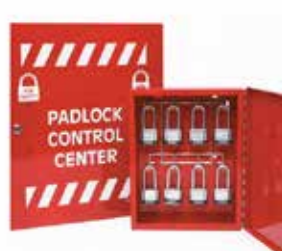
Padlock Control Centre – 8 Hooks