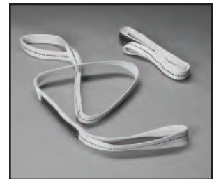
Nylon Sling Accessory Model 8510 Series

The compact design of Sky Hook Model 8565 w/Reverse Cherry Picker Base allows easy access into machinery to remove or reposition heavy or awkward items that need to be changed, modified or stored after use. With the flexibility of 15° rotation in each direction from center, Sky Hook Model 8565 allows you a full 30° range of motion when working in tight areas.