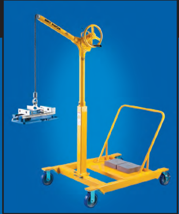
Accessory 8515 Vise Hook and Accessory CW1-8570 Individual Counterweight shown above (Sold separately)