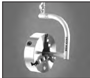
Chuck Hook Accessory Model 8520