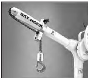
Choker Collar Accessory Model 8507