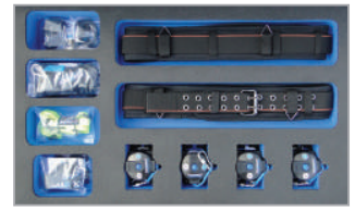
Derrick Maintenance Kit - Drawer 5