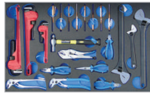
Derrick Maintenance Kit - Drawer 3