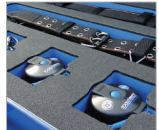
Derrick Maintenance Kit - Drawer 6