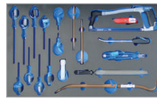
Derrick Maintenance Kit - Drawer 4