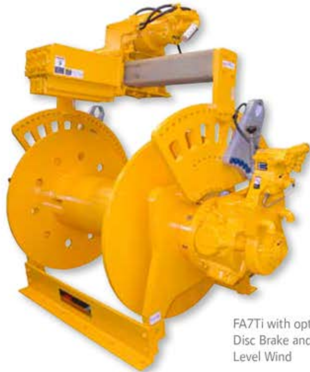
FA7Ti with optional Auto Disc Brake and Accuspool Level Wind