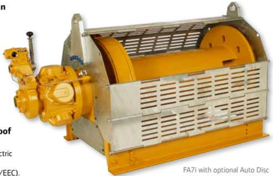
FA7i with optional Auto Disc Brake and Drum Guard