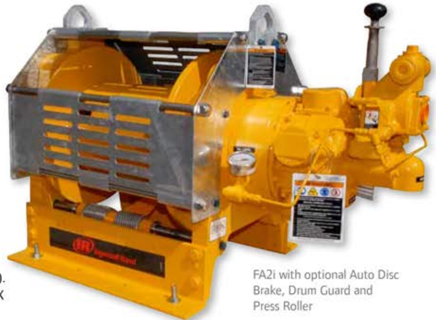
FA2i with optional Auto Disc Brake, Drum Guard and Press Roller